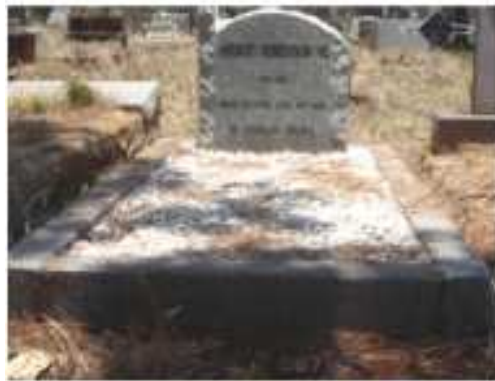
The New Grave, erected by a Bulawayo resident, Clive Midlane. Note the plot number, 887 in the foreground.