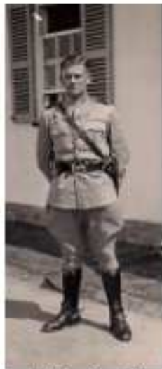
"Schollum" Presumably 3693