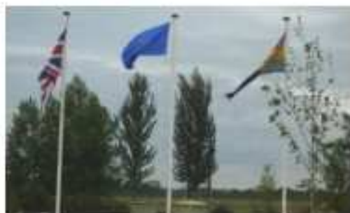
Entrance to the Arboretum, Sunday 25th July 2010

Although the day was, by now, slightly overcast, it was brightened significantly by the sight of the BSAP flag fluttering proudly next to the Union Jack.