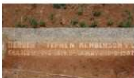
The clearly marked "headstone" at grave 887.

However Henderson's grave is actually sited in Sec. Gen 2 extension - also (rather confusingly) plot 887 where he is buried next to his wife.